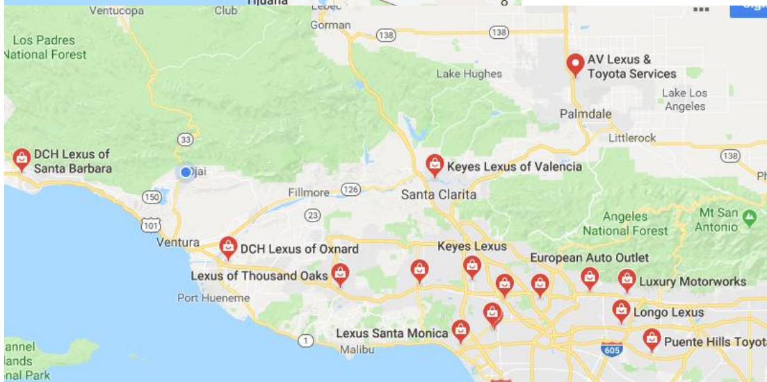
Area map of Toyota and Lexus Dealerships